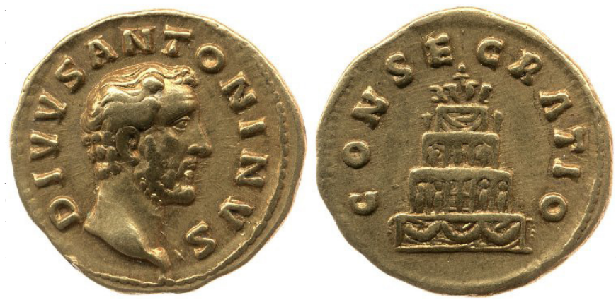
Figure 2: Gold Coin, British Museum (museum number G3,RIG.223)

The obverse side depicts the head of the deified Septimius Severus