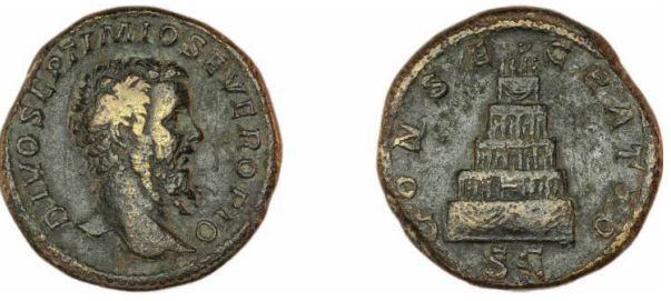
Figure 1: Bronze Coin, the British Museum (museum number R.15919)

Below is an image (Fig. 1) of a bronze or brass sestertius issued by Caracalla and Geta in 211 CE from the British Museum's coin collection